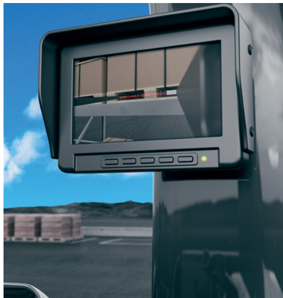
Monitor view before load pick-up

For even higher safety we recommend the combination with SmartFork® Laser.