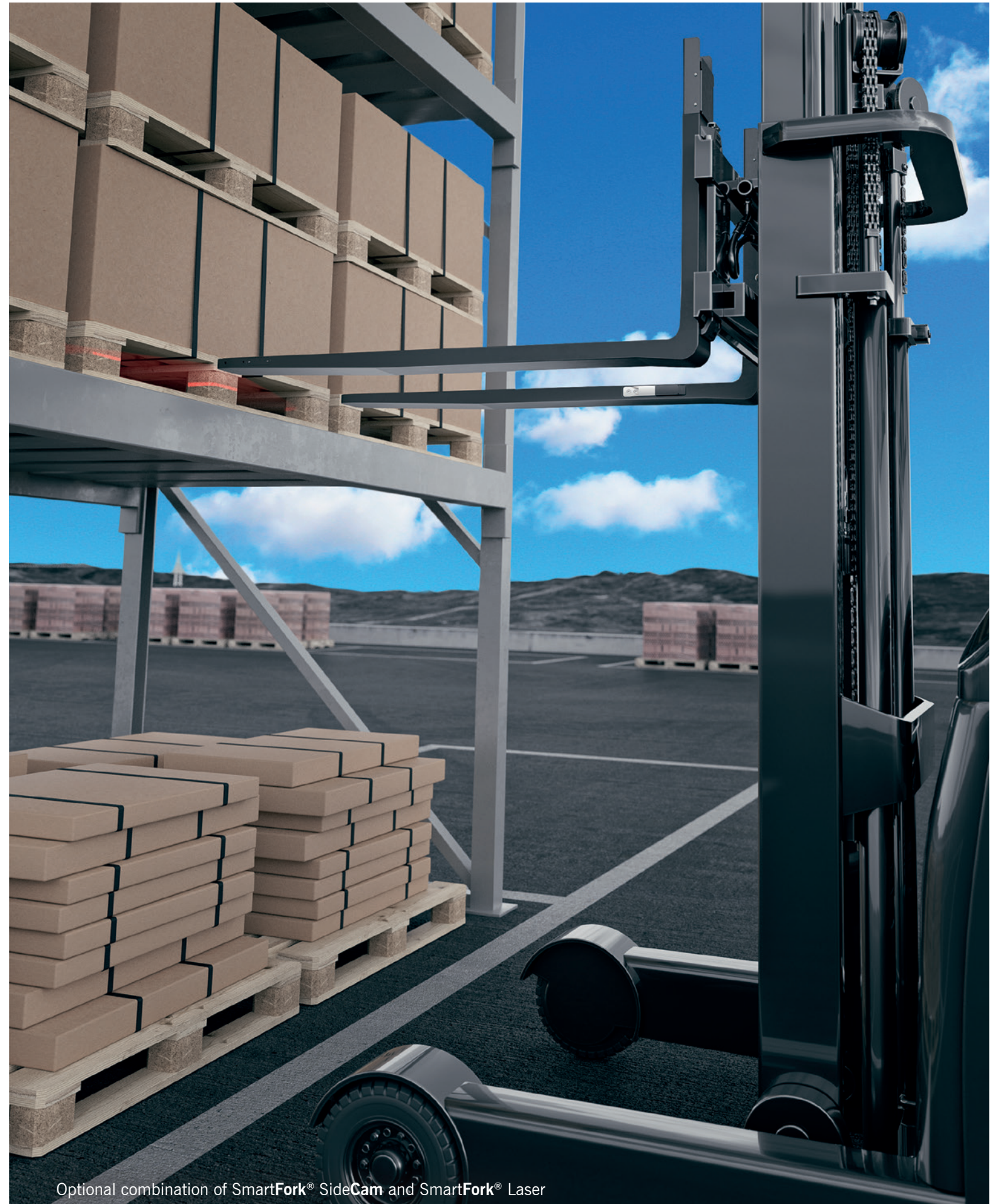
Optional combination of SmartFork® SideCam and SmartFork® Laser